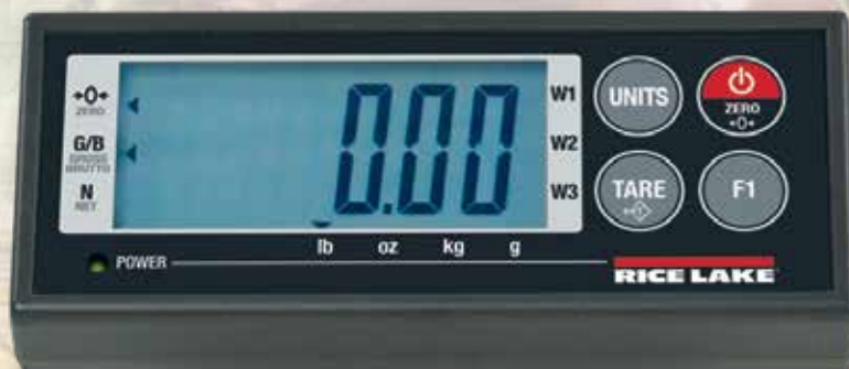
Large 1 inch configurable backlight setting