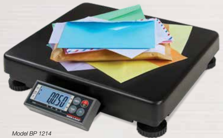
Model BP 1214 with plastic shroud

The multi-range and multi-interval BenchPro scale is ideal for postal applications. From small, lightweight envelopes to larger packages, BenchPro postal scales accurately weigh each package while easily integrating into a small mailroom.