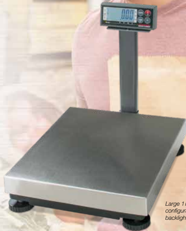
Large 1 inch configurable backlight setting