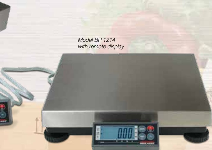
Model BP 1214 with remote display

BenchPro scales can be equipped with an additional post mount or table top display to allow both the customer and operator to easily view weight at the time of transaction. The scratch-resistant, tempered glass display keypad provides drop resistance and also repels water, dust and oil for lifetime durability.