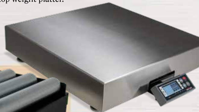
Model BP 1818