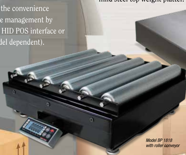
Model BP 1818 with roller conveyor

In shipping environments, BenchPro is ideal for capturing weights of outgoing packages and parcels. BenchPro handles most standard packages with its variety of model capacities and offers a large scale base with optional roller, ball top or mild steel top weight platter.